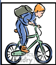
(ride his bike)