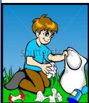
(pick up rubbish)